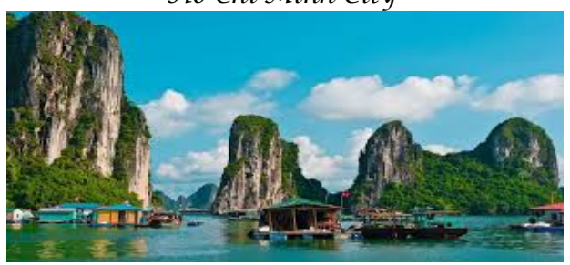
Ha Long Bay