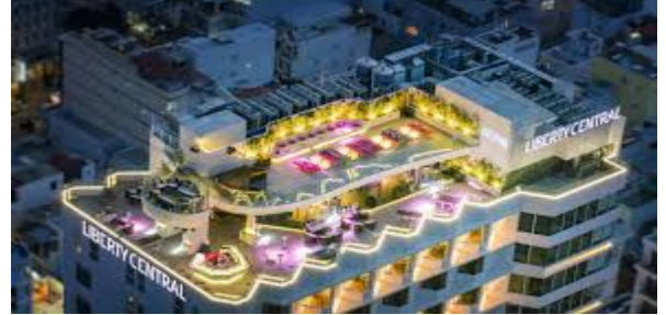
Hoi An Nha Trang